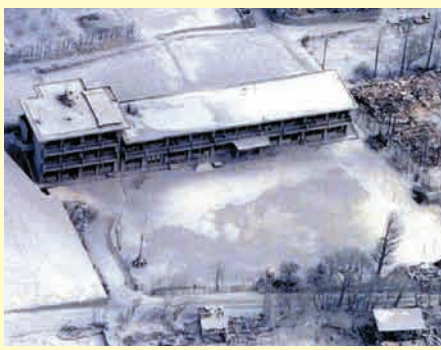
†ruins of former Onokoba Elementary School building

The ruins of former Onokoba Elementary School building was lost by the pyroclastic flow. But now new school building was reconstructed and removed to the little south from original place by the grateful support. Nowadays the lively voice of kids we could hear.